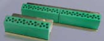
Driver Guide Blocks